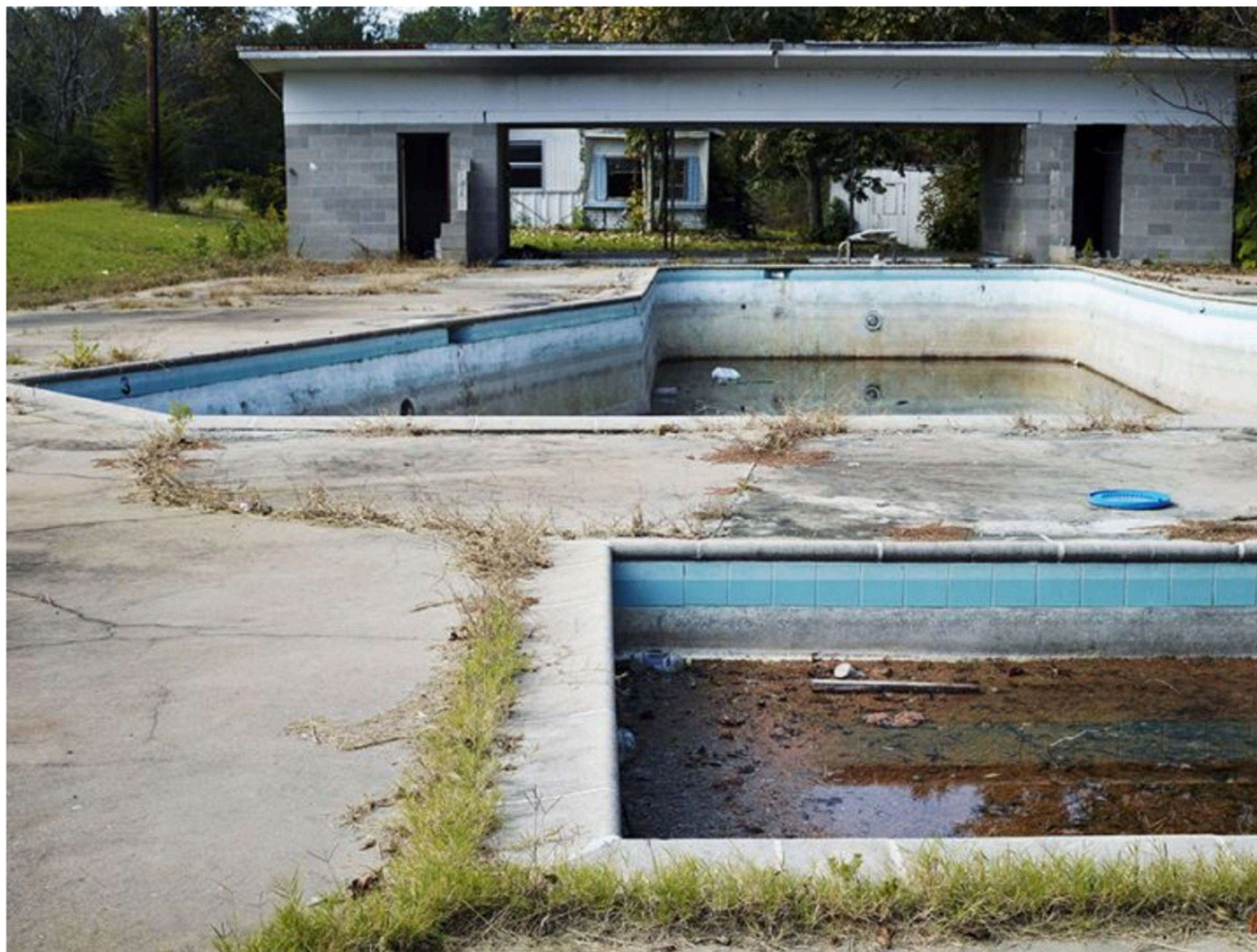
The Other Side of Christmas